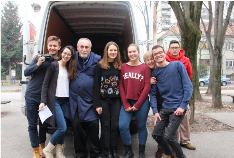
Donations for Gornja Bistra Hospital