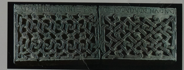
Inscription of king Stephen Držislav